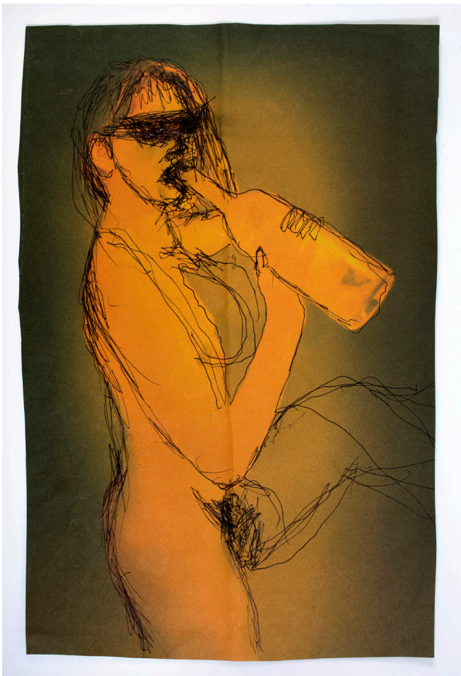
Woman with Bottle

Andipa is delighted to present The Eternal Buzz and the Crock of Gold , an exhibition by the acclaimed singer-songwriter Shane MacGowan. His work, which has been described by the art critic, Waldemar Januszczak, as possessing a 'demented, wild, fascinating, scabrous kind of energy', will be represented by eighteen small-scale drawings mostly dating from the 1980s.