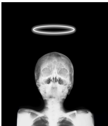
The Star, 2015

Inspired by the tradition of the Vanitas , relating to the transcendence of earthly life, de Cadenet's work explores a deeper representation of self, beyond flesh and bone, creating a timeless snapshot of the current moment with a medium that speaks to our past and future alike. The resultant radiograph cannot be created in Photoshop and is an authentic record of the subject's identity.